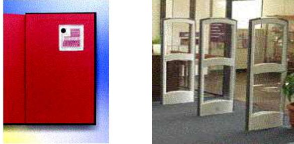
Figure 2: On the left, a Checkpoint library RFID tag. On the right, an exit gate.

RFID tags communicate with the reader by passively modulating a radio signal broadcasted by the reader. Because a reader is little more than a radio transceiver, this means that attackers will be able to obtain illegitimate readers that can be used to query RFID tags from some distance. Library RFID vendors claim that their readers can interact with tags from a distance of 2 feet (for large sensors at library exits), and hand-held readers might work up to 8 inches away from the tag [29, 3]. 3 These distances are limited primarily by national regulations limiting reader power; thus, we should be prepared for illegal readers that might have a read range several times larger.