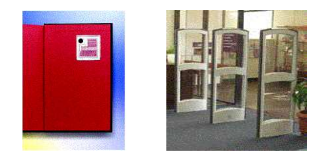
Figure 2: On the left, a Checkpoint library RFID tag. On the right, an exit gate.

RFID tags communicate with the reader by passively modulating a radio signal broadcasted by the reader. Because a reader is little more than a radio transceiver, this means that attackers will be able to obtain illegitimate readers that can be used to query RFID tags from some distance. Library RFID vendors claim that their readers can interact with tags from a distance of 2 feet (for large sensors at library exits), and hand-held readers might work up to 8 inches away from the tag [29, 3].<sup>3</sup> These distances are limited primarily by national regulations limiting reader power; thus, we should be prepared for illegal readers that might have a read range several times larger.